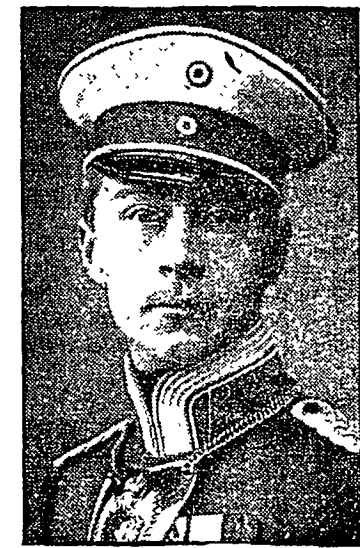
EX-CROWN PRINCE FREDERICK WILLIAM.

Details Lacking According to a Brief Dispatch Received by Press in London